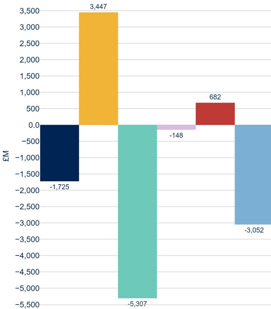
Figure 2: TRAC full economic cost surplus/(deficit) by activity, 2022-23 (UK higher education institutions)