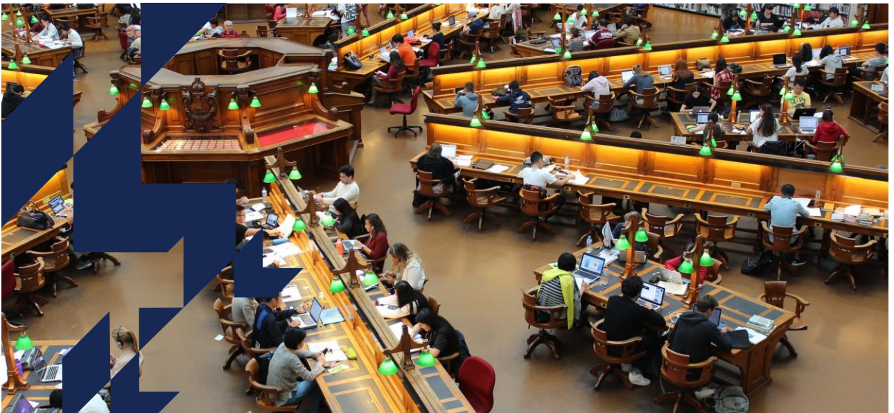
Table 1 - Counting your students