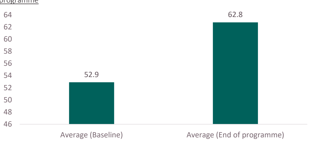
Figure 4.1: Average Partnership Assessment Tool score at baseline and at the end of the MHCC programme