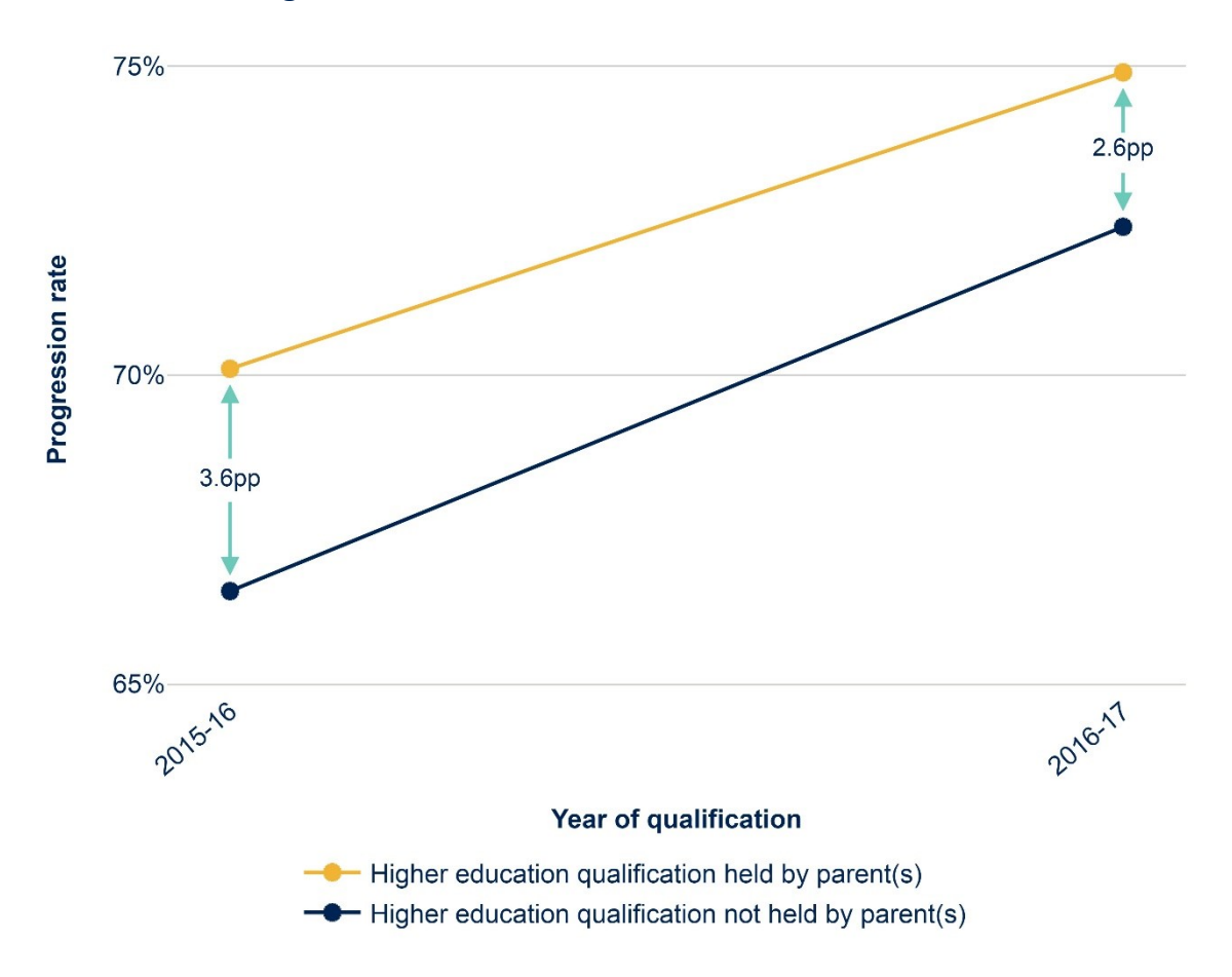
Figure D3: The differences in students progressing into highly skilled employment or further study at a higher level by parental higher education for full-time, UK-domiciled, undergraduate students

The data used to create this chart can be found in the data file associated with this publication.<sup>17</sup> Details of the student population can be found later in this annex. The data for 2015-16 consists of a reduced population and is less robust than the data for 2016-17; see paragraph 22 for more details.