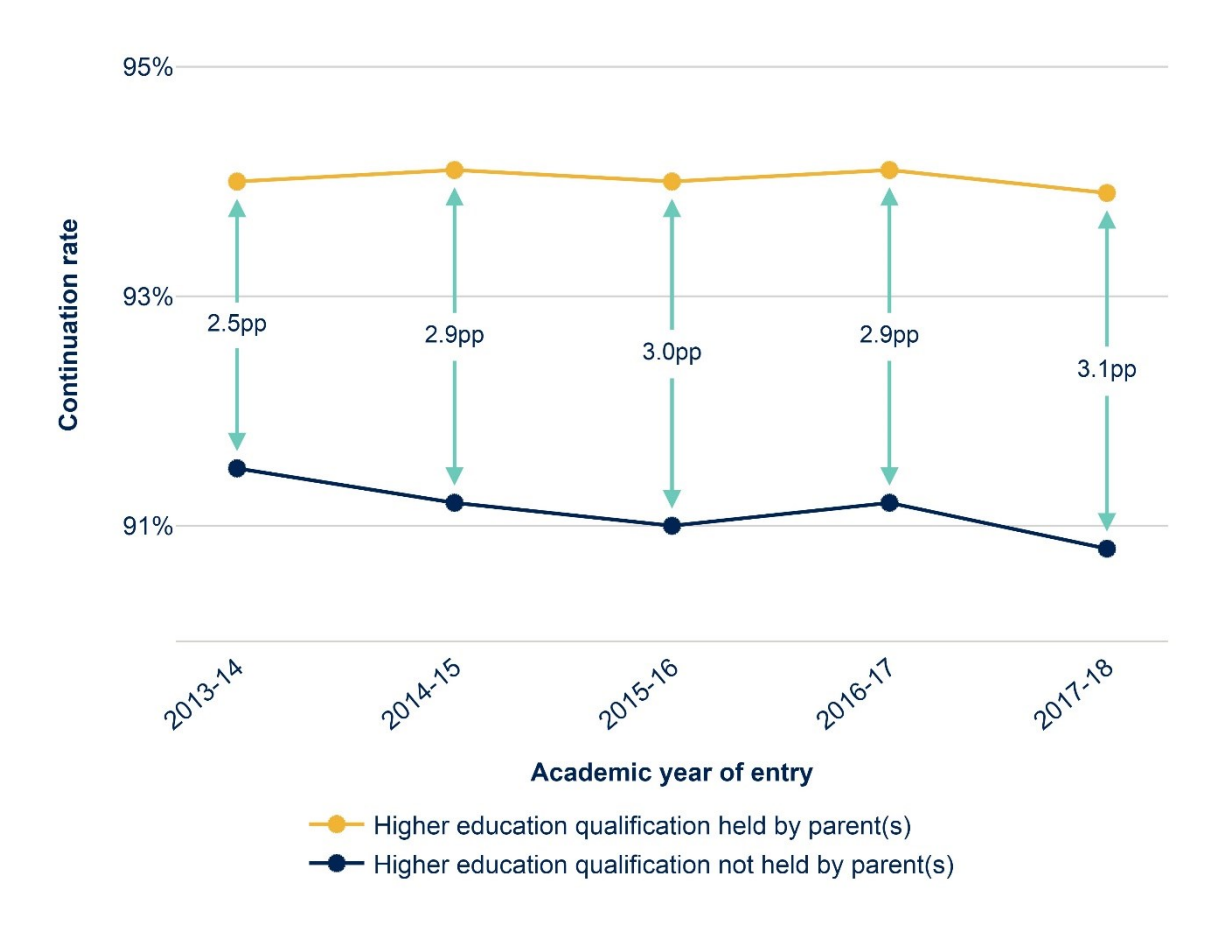
Figure D1: The differences in continuation rate by parental higher education for full-time, UK-domiciled, undergraduate students

The data used to create this chart can be found in the data file associated with this publication.<sup>5</sup> Details of the student population can be found later in this annex.